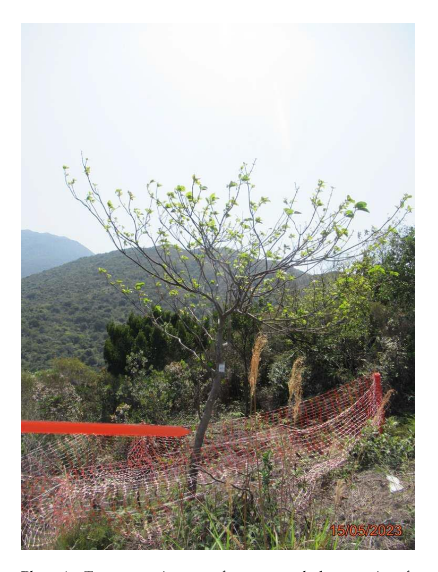
Photo 1 – Tree protection zone for preserved plant species of conservation importance